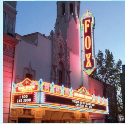
Bob Hope (Fox) Theatre