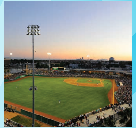
Banner Island (Stockton) Ballpark